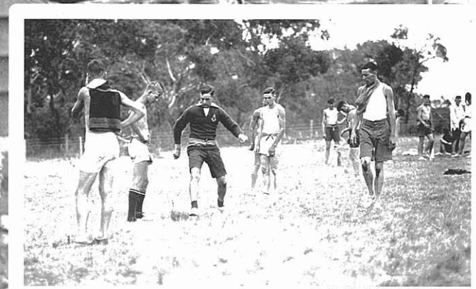
Football Dribble at The Games